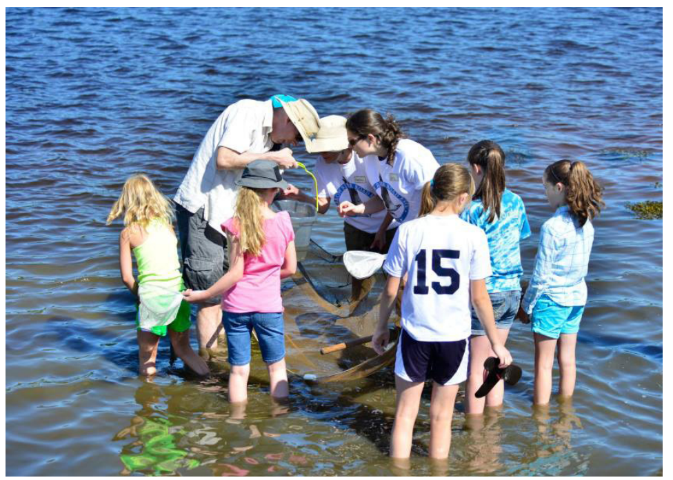
On June 15, scientists young and old explored the shoreline and marshes at Middlebridge to discover "What Lives in the River?" This was the first in a series of educational events sponsored by Narrow River Land Trust and NRPA in cooperation with Narragansett Parks and Recreation. See the story and additional photos on page 7.