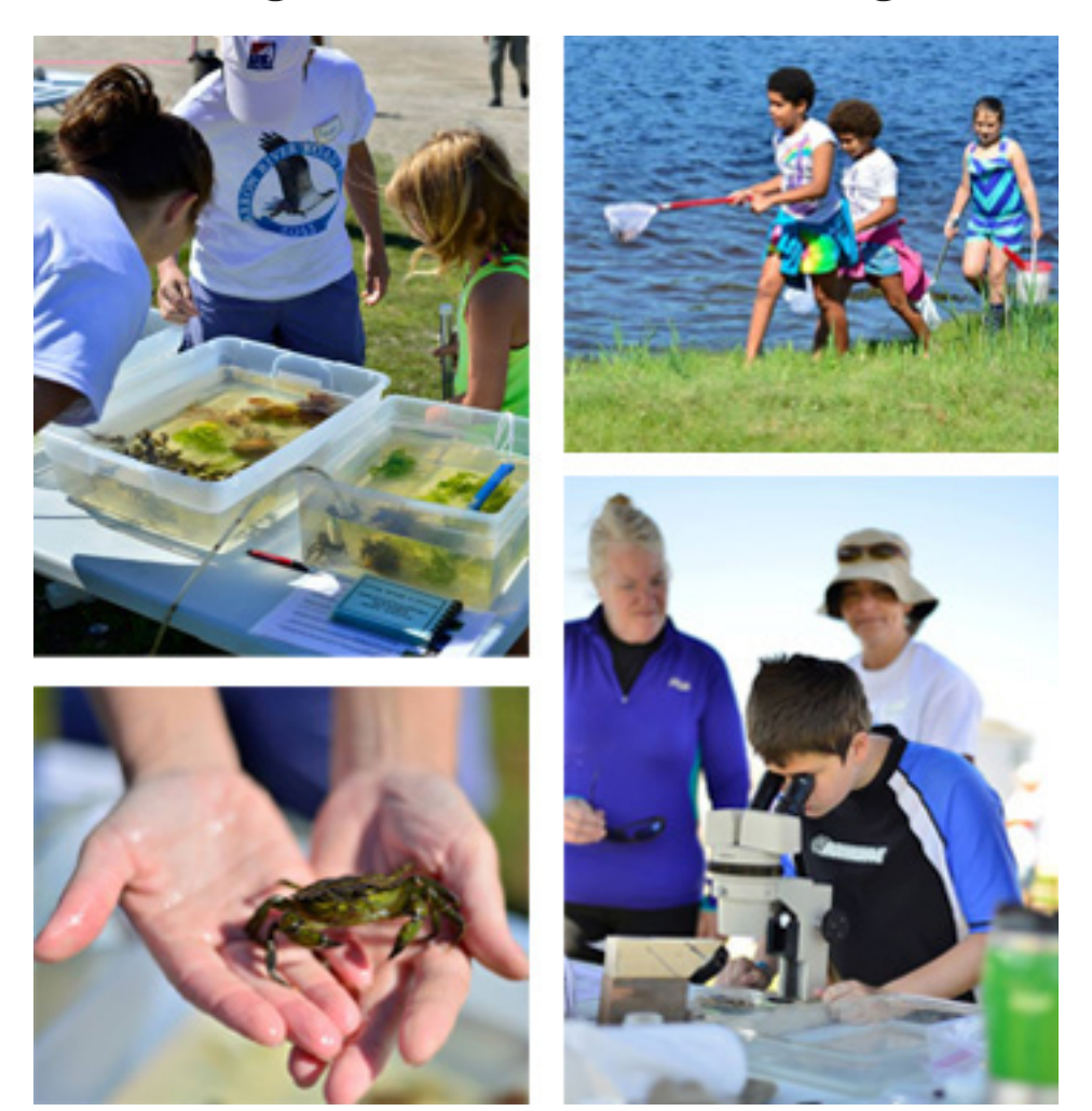
Hands-on Science: More than 40 children and adults participated in the What Lives in the River? event on June 15 at Middlebridge, where they collected samples from the river and then took a closer look at the creatures, sometimes using a microscope on loan from one of the volunteers. For more photos, see the What Lives in the River album on the Narrow River Preservation Association Facebook page.