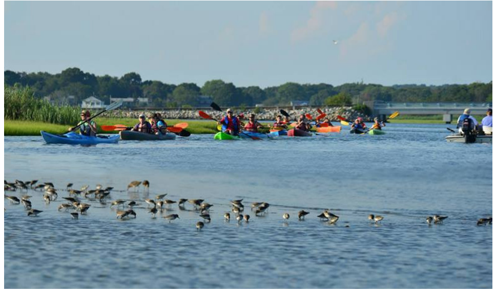
Kayakers set out along the west side of lower Narrow River from Middlebridge in the Sixth Annual Pettaquamscutt Paddle while a flock of small birds feeds on a nearby sandbar.

The tour followed the course illustrated on one of two paddle maps created by NRPA in conjunction with the Rhode Island