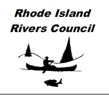
2 NRPA: Preserving the Narrow River Watershed Since 1970