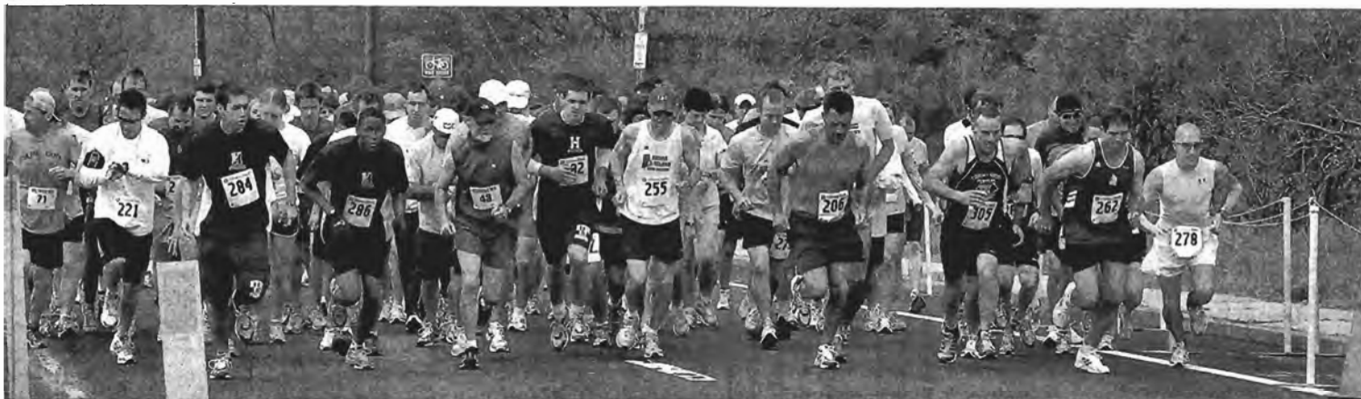
The start of the 10K at the Narragansett Town Beach.

The top woman finisher was Mary Diciaro, with a time of 21:27. The complete results are included in a separate insert in this newsletter.